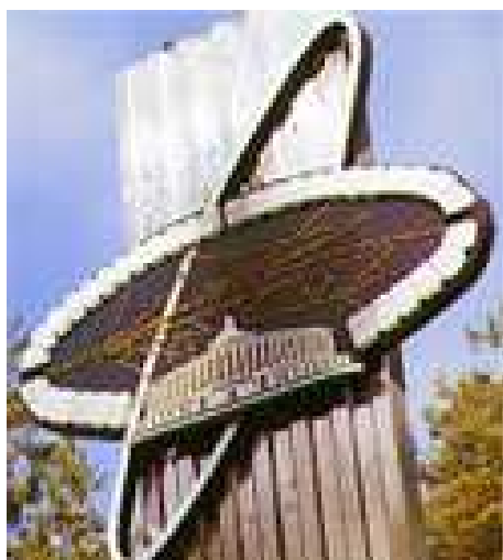
Joint Institute for Nuclear Research (JINR)